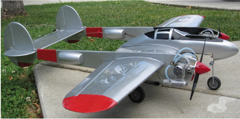
Here are my planes almost ready for the Race.