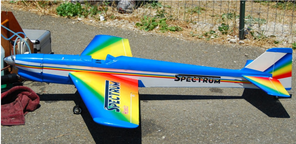
Community Day